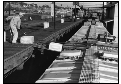
Cooling apple shipments

Purchase your very own copy of the "100 Years of Hort" DVD that was shown at the WSHA 100 th Annual Meeting in Yakima today! This historic video gives an insiders view of the history and future of the Washington tree fruit industry and features many industry leaders.